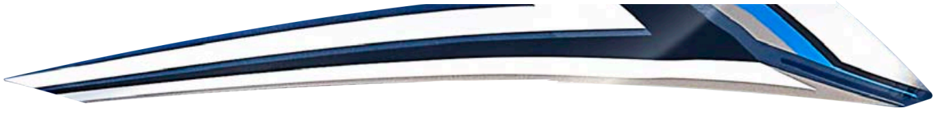
Decent Blue Metallic